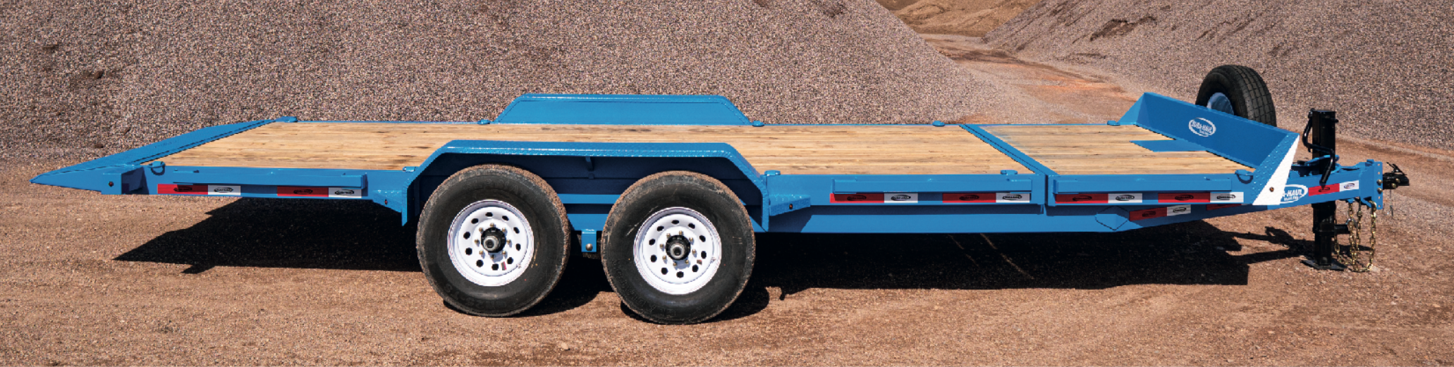
Rubrail and stake pockets on sides