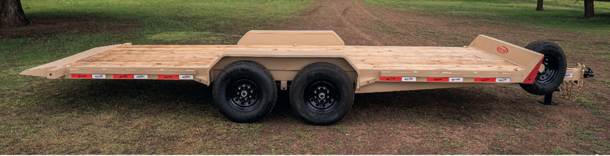
Rubrail and stake pockets on sides