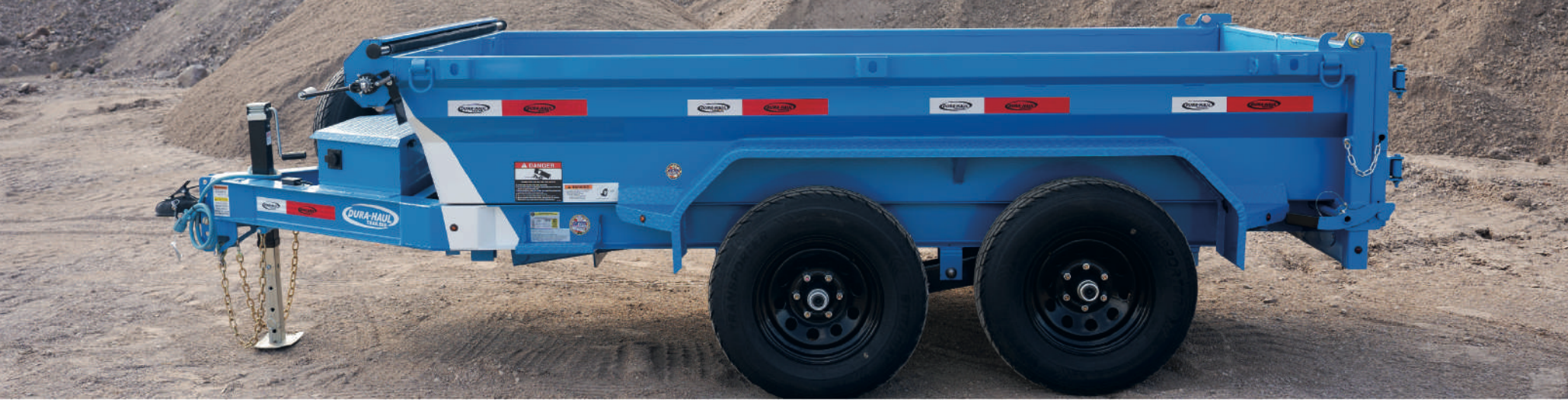
Lockable toolbox, charger, pump, battery & remote control