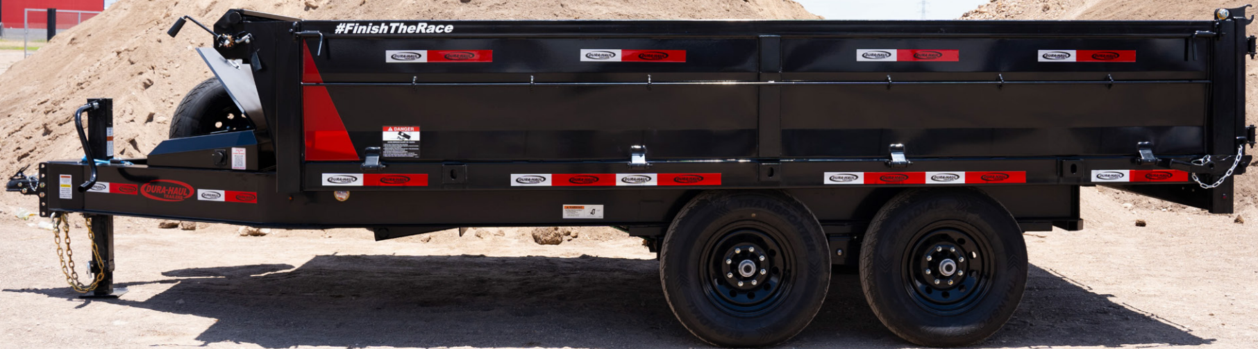
HD quick pull up ramps 5'8" long