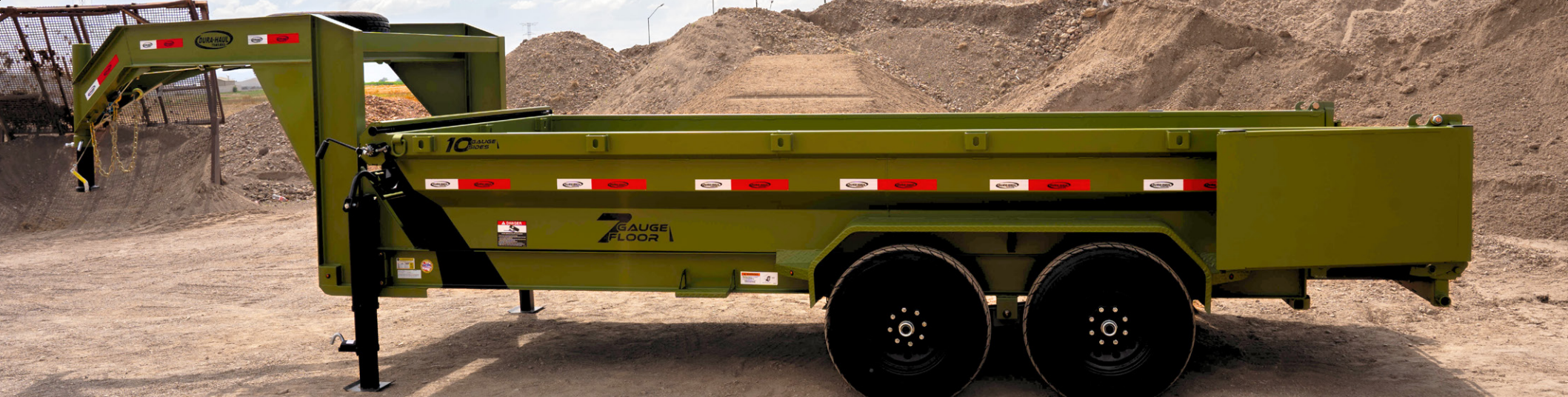
EZ latch for quick release