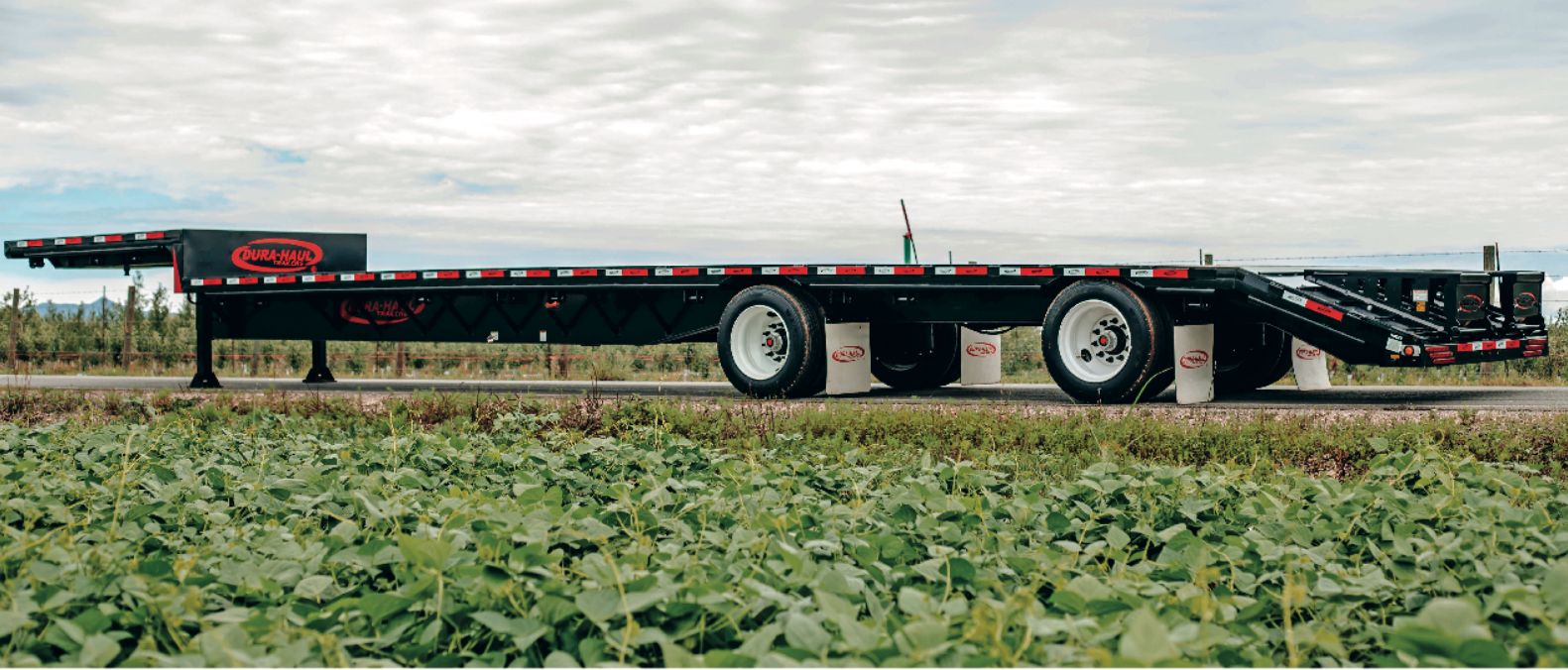
62" upper 8 / 41" lower deck