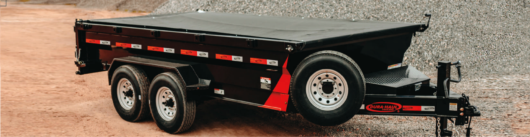
Lockable 2 cu. ft. toolbox, charger, pump, battery & remote control