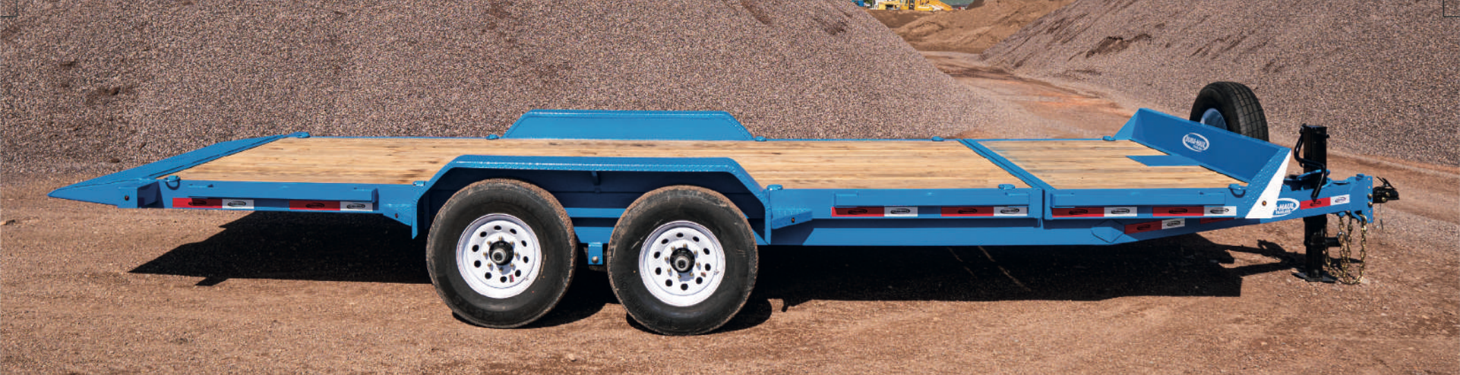
Rubrail and stake pockets on sides