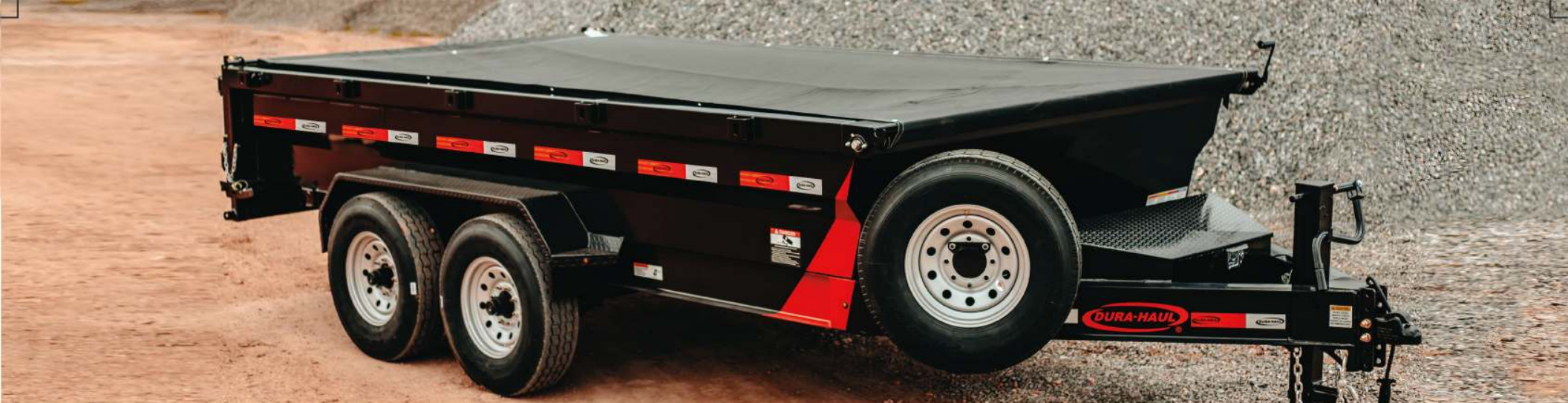
Lockable 2 cu. ft. toolbox, charger, pump, battery & remote control