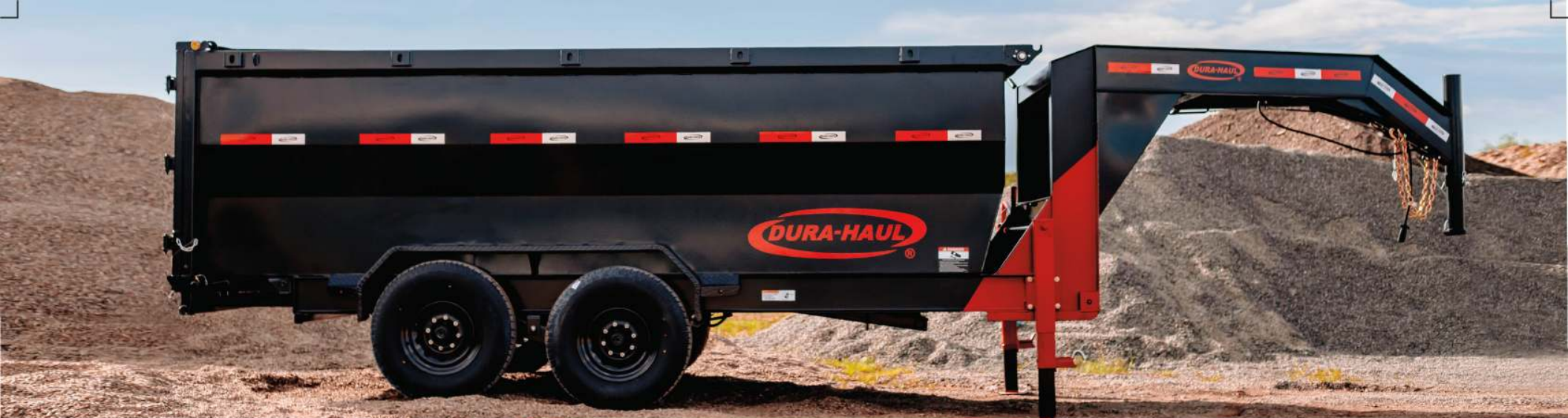
Lockable 3.5 cu. ft. toolbox, charger, pump, battery & remote control